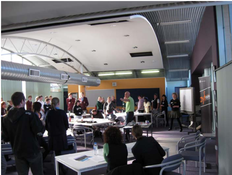
(Photo: Young people participating in a session lead by the lead facilitator in Launceston)

The participants expressed a high level of uncertainty about their prospects of finding employment in Launceston. The conversation and the ideas put forward were both diverse and extensive.