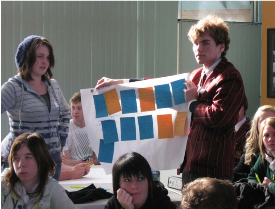
(Photo: Young people present their small groups ideas to forum participants)